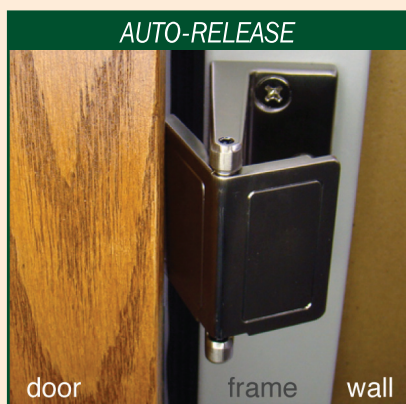
"Touch release"™ to disengage magnet. Also Disengages quietly upon door closing. Spring resets "SAL"

Eliminate the biggest "problem product" in the industry: