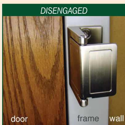
Spring holds "SAL" in unlocked position Push to engage and secure.

View animated demonstration online at http://dhsi-seal.com/securelatch.htm