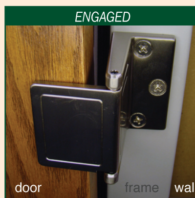
Magnet holds "SAL" in locked position. Prevents door from opening